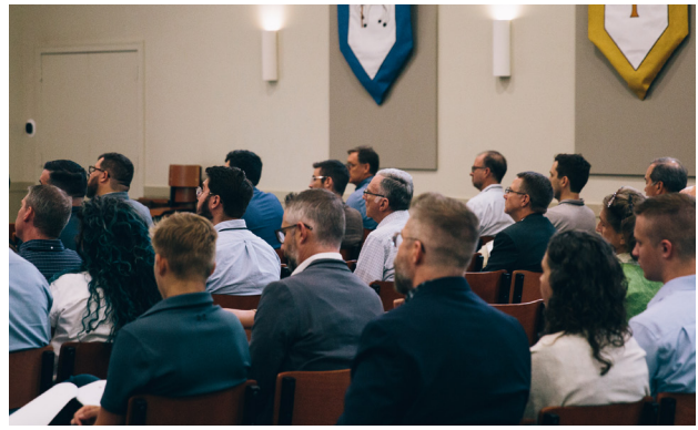
1 Theopolis Ministry Conference