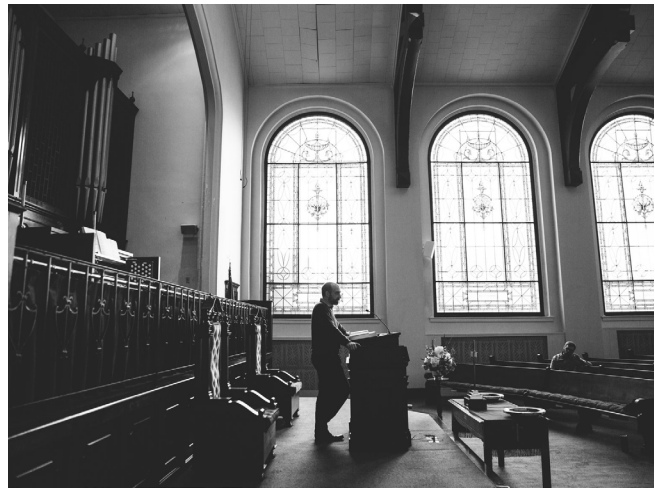
9 Scholarship Fund