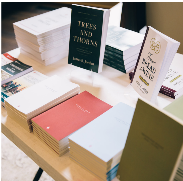
2 "Trees and Thorns"