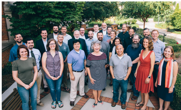
3 Esther Meek's class

We completed our first Fellows Program . Three students went through the program, and two completed the requirements to receive a Fellows Certificate.